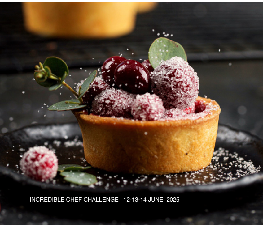
INCREDIBLE CHEF CHALLENGE | 12-13-14 JUNE, 2025