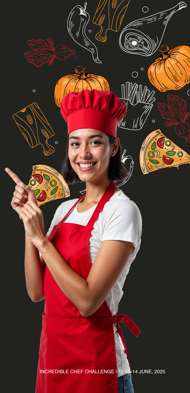
INCREDIBLE CHEF CHALLENGE | 12-13-14 JUNE, 2025

Champions who use new ingredients and dishes to influence an entire industry